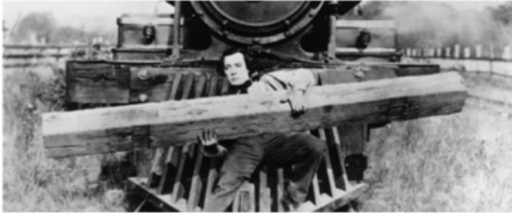
Buster Keaton in The General

Silent films, when originally shown, were accompanied by an organ, piano, and sometimes a full orchestra. A good score enhances the action, but never overshadows it.